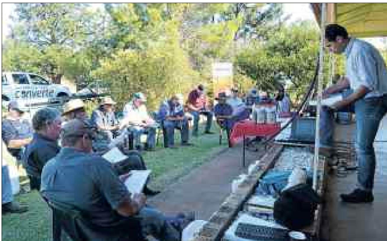
There was a good turnout for the Convertte on farm biological farming field day at Barellan, NSW.